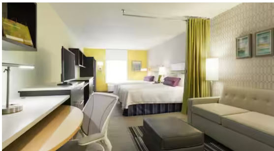
2 Queen Beds Studio Nonsmoking

On the cut-off date, the hotel will release the unreserved rooms for general sale. Any reservations received after the cut-off date will be accepted on a space or rate available basis.