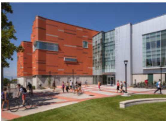
North View of South Entrance of ESLC